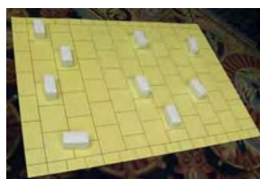
Yellow Brick Road