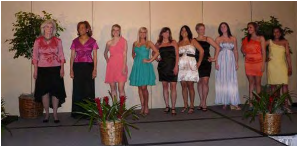
Models in Belk's Evening Apparel First Annual EWI of Little Rock Fashion Show