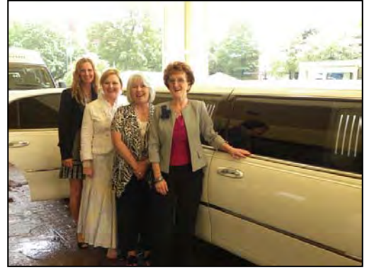
Raffle Winners Enjoyed Limo Ride to the Show